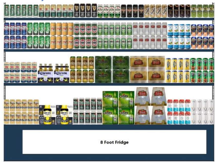
Beer & Ready to Drink - Cooler Section

4 X 4 Seasonal Display examples (16 Sq. Ft.) to be used to showcase seasonal products or sale items